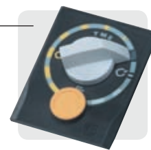
TME CABIN STATION