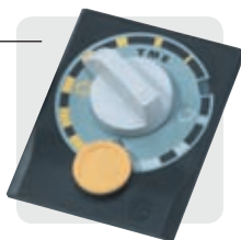
TME REMOTE STATION